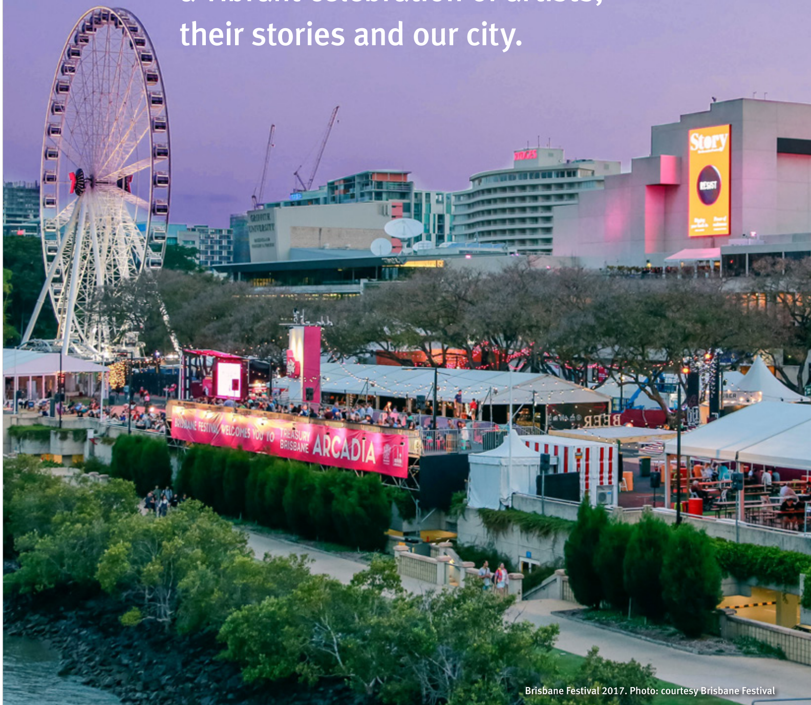
Brisbane Festival 2017.

For more on how we support Queensland's artists to deliver quality arts experiences across the state visit